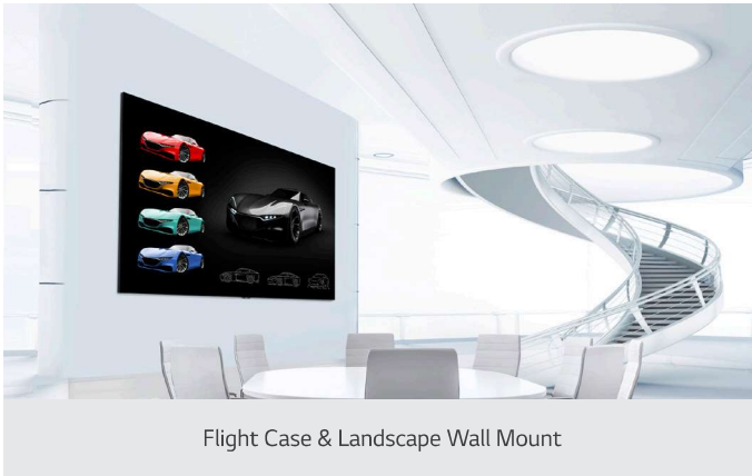
Flight Case & Landscape Wall Mount